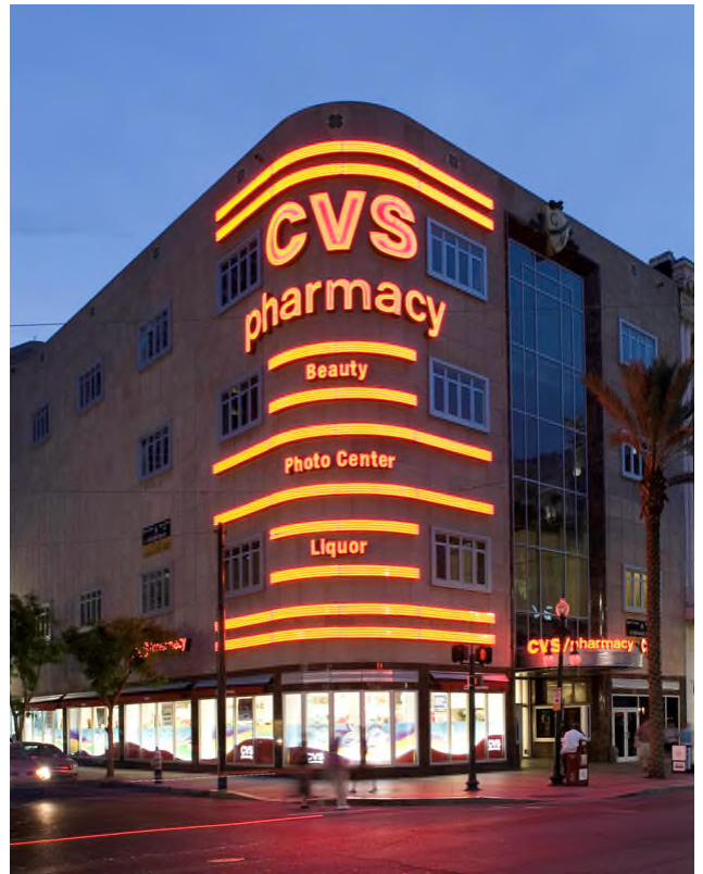
Last Updated on February 11, 2021

New Orleans is a melting pot of cultures old and new and it comes with the intriguing antique shops, fascinating art galleries, and trendy boutiques that are the natural accoutrements of these cultural fusions. The city is a dreamland for shoppers with the diversity of shops found everywhere from Magazine Street to Mid-City. Alongside changing styles and trends, customers expect a retail shop's atmosphere to enhance the shopping experience. Safety and security are the top things both retailers and consumers are looking for in shops.